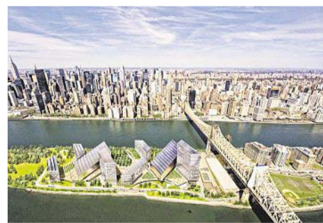
An artist's rendering shows how the New York City campus to be operated by Cornell University and Technion-Israel Institute of Technology will look in 2017.