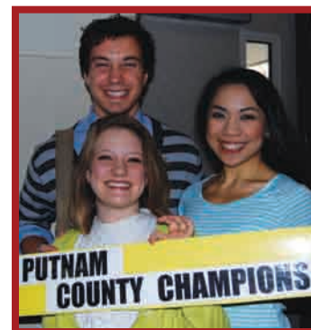
Hangar actors from Ithaca College spelled and sang at the 2010 Bee. Mark your calendars for the 13th Annual Adult Spelling Bee on Sunday, Nov. 13, 2011.