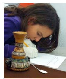
BJM Past & Present