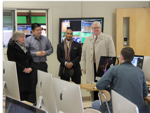
IHS Digital Media