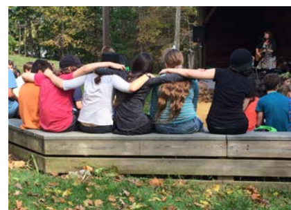
LACS students at an annual fall retreat.

LACS uses the Ithaca and global Community as our school but also strives to be a just and caring community within our building. The fundamental decisions about the school are debated and decided, one-person one vote, at our weekly All School Meetings. Each student also participates in a committee that runs some aspect of the school, including Maintenance, Site-Based Council, Locovores and the Alternative Community Court. Close student-staff relationships are central to building a feeling of shared ownership and respect at LACS.