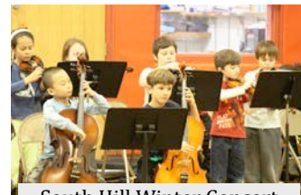
South Hill Winter Concert