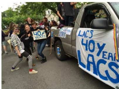
LACS students celebrate the 40th anniversary at the Ithaca Festival.