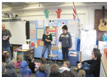
LACS students at an elementary school.

LACS incorporates learning outside of the classroom, including community service, career explorations and spring trips. During the last week in May the school divides into 20+ groups; backcountry canoeing the Grand Canyon of Pennsylvania, working at the Akwesasne Freedom School, living in a Spanish speaking nation, building homes in New Orleans, and learning in more than a dozen other venues.