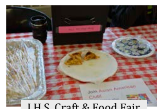
I.H.S. Craft & Food Fair