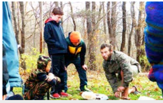
Boynton Pandemics & Geography