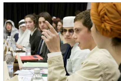
10th grade LACS students demonstrating their learning in the week-long Middle East Debates.

From the start LACS was to be an Alternative to the education found at Boynton and Dewitt middle schools and at Ithaca High School. While our school's unique graduation requirements incorporate New York State and Common Core standards, our students graduate not through "credits" and Regents exams but after demonstrating skills and knowledge in 15 different essential areas through portfolios and public performances. Our curriculum emphasizes in-depth project-based learning through student-centered pedagogy.