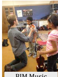
BJM Music Program