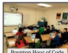
Boynton Hour of Code