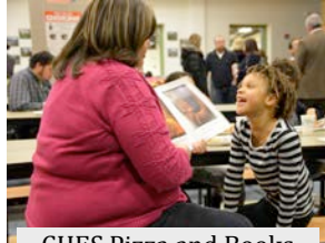
CHES Pizza and Books