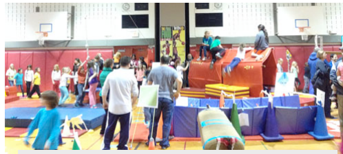
CHES Great Escape & Great Give Back