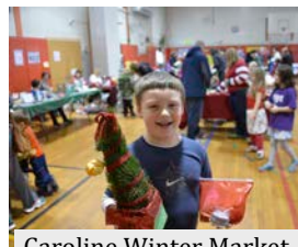
Caroline Winter Market