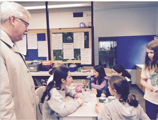
Fall Creek Elementary School