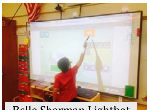
Belle Sherman Lightbot