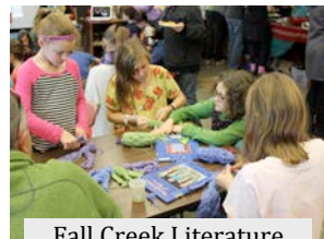
Fall Creek Literature Celebration