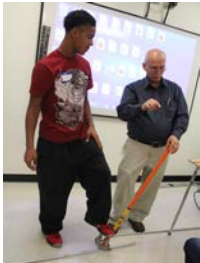
DeWitt Career Day

Click the images below to view updates from our schools on their websites: