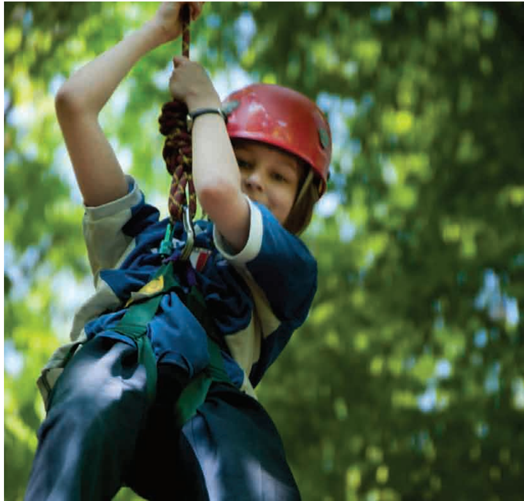
AN ITHACA STUDENT "DISCOVERS THE TRAIL."

Teachers report the interactions with partner classrooms often begin before the trips, with kids communicating by letter, e-mail or video, and continue on the bus ride to and from the sites. Some interactions grow into friendships as 52 percent of 6th grade students report